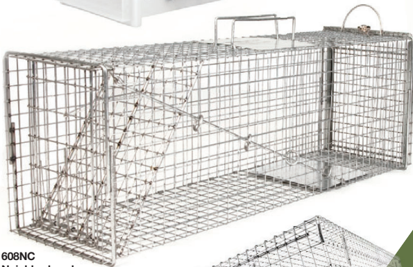
608NC Neighborhood Cats 36" Trap