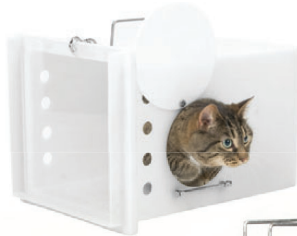
711 Cat Den / Carrier

The Tomahawk Live Trap team appreciates the passion caregivers have for the animals they work so hard to help. We are proud to offer quality equipment and superior customer service to support those efforts. Our team works hard to provide the best traps and animal handling equipment available with input from organizations such as Neighborhood Cats and FixNation . Our products are effective, easy to use, reliable and safe for you and the animals you care for.