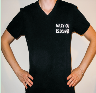
V-Neck T-Shirt $18 each

BPA-free stainless steel water bottle holds 20oz of liquid. Color is blue.