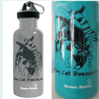
Water Bottle $10 each

MD residents please add $0.96 sales tax.