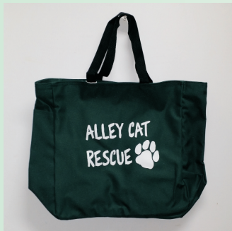
Tote Bag $15 each

MD residents please add $1.20 sales tax.