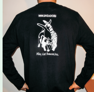
Long-Sleeve Shirt $20 each

MD residents please add $1.08 sales tax.