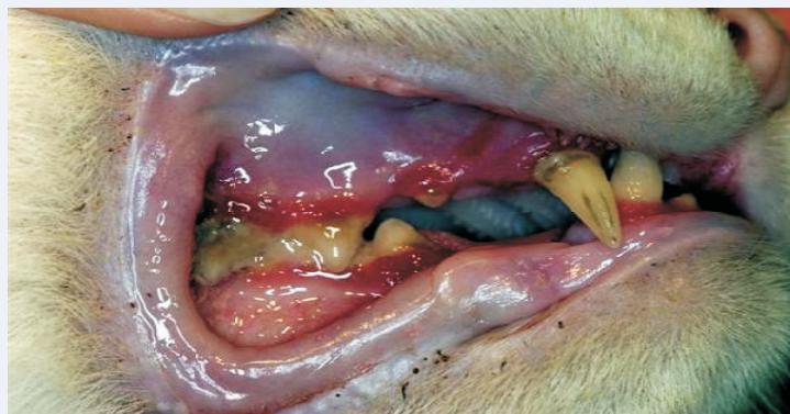
Six-year-old cat with periodontal disease and stomatitis.

For the most part, cats just need a variety of foods, both wet and dry, and a vet's attention and their teeth should remain healthy. While it might be overlooked, dental health is vital to the overall health of cats and must be taken into consideration, even with simple actions like brushing your cat's teeth at home. And remember, March is dental health month and many vets offer discounted prices for teeth cleaning, so take advantage of these sales and stay ahead of tartar and plaque buildup to prevent dental disease and other serious health conditions.