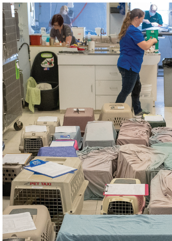
Angels of Assisi, Roanoke, VA. Their high-volume clinic can spay/neuter up to 100 cats in a day.