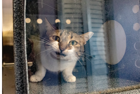
Shelters are unfamiliar & stressful places for feral cats, who often react with unsocial and defensive behavior.

We can’t expect community cats to thrive and succeed in a traditional sheltering environment. They’re a square peg to a traditional program’s round hole. TNR and RTF succeed because they meet community cats where they are and accept their unique characteristics. When implemented in conjunction with accessible spay/neuter programs, the result is more available cage space, staff time, and funding, for sick, injured, or surrendered cats, and most importantly, more cat lives saved.