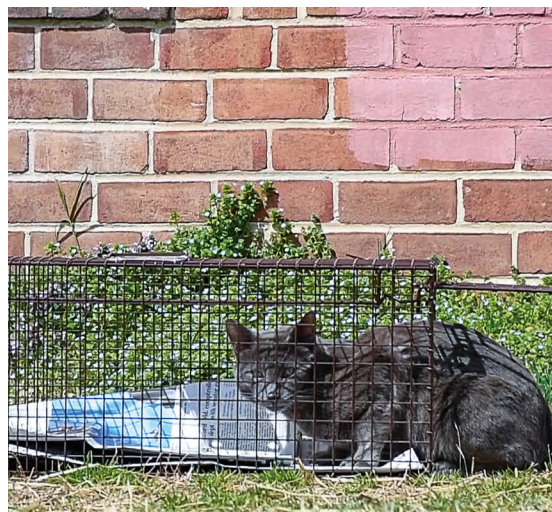
Humane box traps are used to safely and securely trap cats for TNR.