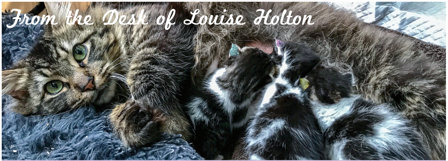
Feral cat Moira, who gave birth to her kittens at a municipal shelter in March.

Who doesn't love kittens? Well, we know some environmentalists don't, but for the most part the world loves cute kittens. But, can we have too much of a good thing? The answer is sadly, YES!