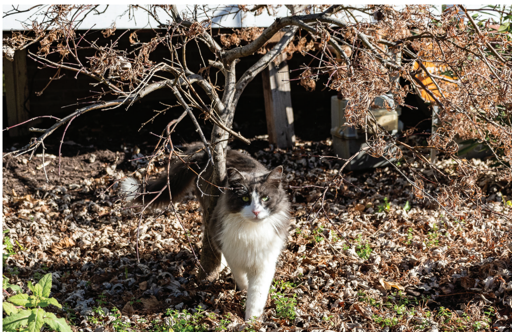
Community cats prefer to live outside, separate from people. A backyard or space under a porch can be their Garden of Eden.