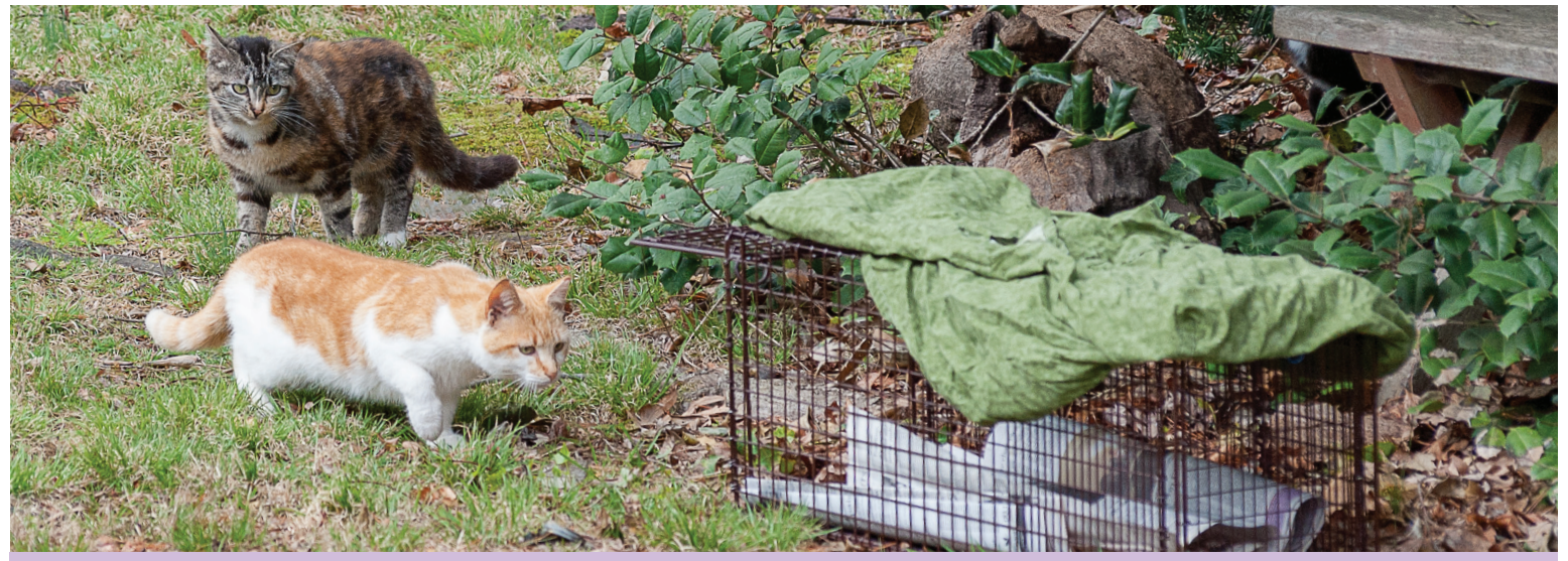
Trap-Neuter-Return can be used to manage community cat populations without resorting to killing

Scientists opposed to this school of thought believe this is a naïve approach in that it's biased towards non-native (i.e. invasive) species, which when left unmanaged can be detrimental to ecosystems. Feral cats are often placed into the category of non-native, invasive species and labelled a "nuisance," but ACR believes that this categorizing of species is often arbitrary, especially in today's world as travel and trade continue to increase. Traditional conservationists still claim that if not removed from the environment, feral cats will in some way "take over," despite numerous studies that show habitats fair better when cats are TNR'd rather than removed. What's naïve really is to deny the inevitability of ecological globalization.