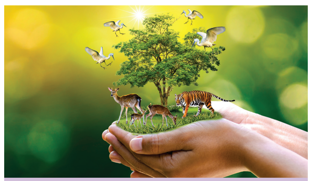
Compassionate conservation is a new way of thinking about biodiversity that considers individuals and populations as a whole.

Whether the topic is feral cats or Bengal tigers, bald eagles or pigeons, when it comes to managing animal populations, the traditional school of conservation thinking tends to choose lethal practices as its primary tool. However, with new research and evidence showing that nonhuman animals are more similar to humans than not–studies proving these species think, feel, and possess sentience—traditional conservation is being challenged by a new ethos called "compassionate conservation," where nonlethal practices are the focus.