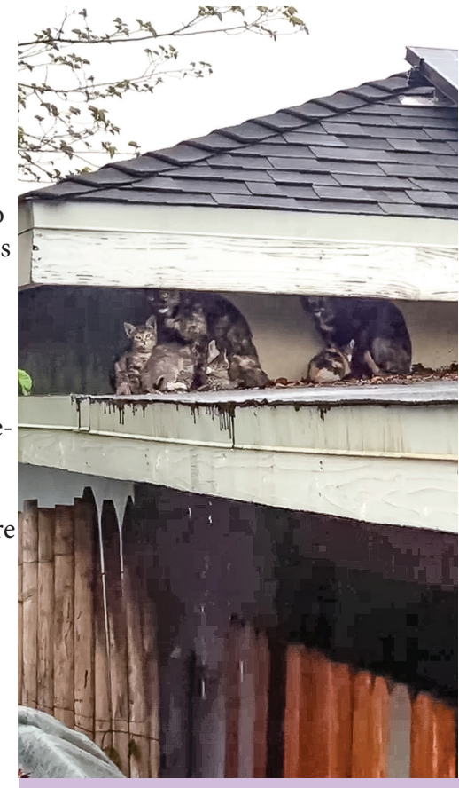
Noms & kittens on a roof in LA

One of these projects involved rescuing two mothers, their nine kittens, and one male from a residential rooftop. Always intrepid, our team found a way to trap on the roof and then get cats in traps down a ladder. A few of these kittens faced challenges with illness, including emergency trips to the vet for high fevers, but after attentive care and socialization, each pulled through and was adopted into a loving home!