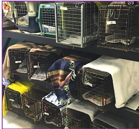
ACR Extends FFC

For 2020, ACR is launching the Feral Fix Challenge. As a result of the pandemic and the subsequent closure of spay/neuter clinics, the Challenge will be extended through the end of October in order to sterilize cats before kitten season begins. Participating vets are critical