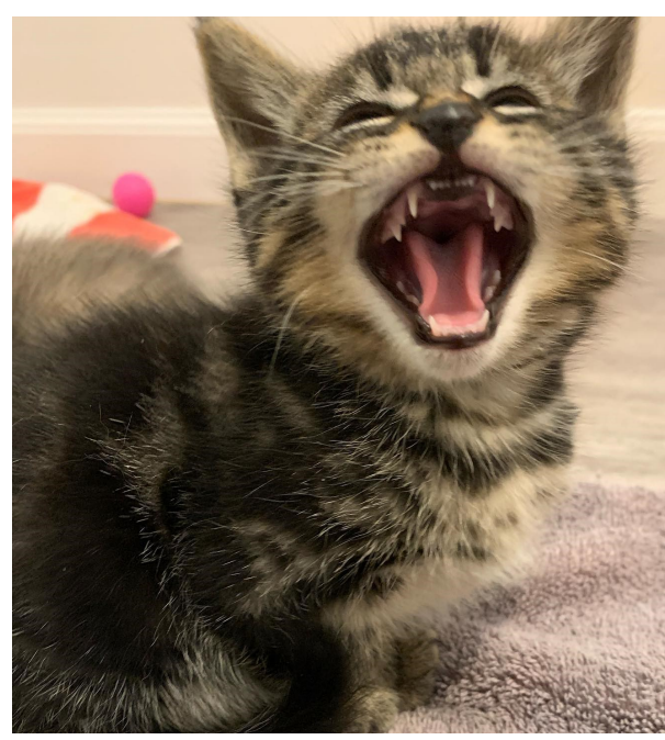
Feral kitten hissing.

Young kittens who have not been handled by humans will spit and hiss. They will be