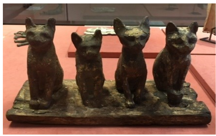
The ancient Egyptians revered cats and immortalized them in statue form.

The early Christian church became aware of the link between so-called pagan reli-