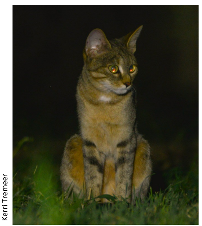
African wildcat (Felis silvestris lybica), considered the ancestor of today's domestic cat.

cats benefited from the availability of food sources around humans (as well as shelter from weather and other predators), while humans profited from a feline form of rodent control.