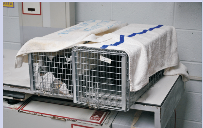
Feral cats post-surgery and treatment. Covering the traps with towels helps to keep the cats calm.

Clients come to our Trap-Neuter-Return clinic because they're looking for a humane way to help the community cats in their neighborhood. And we believe our program succeeds because it is straight forward and comprehensive. As of press time, we've already surpassed our 2014 TNR program numbers by more than ten percent! This program exists because of the generous support of members like you. Please help us continue our work by donating today!