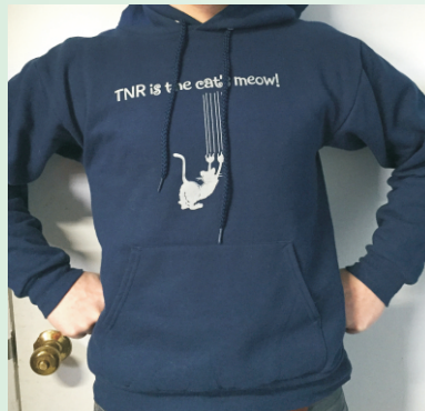
Hooded Sweatshirt $30 each MD residents add $1.80 tax.