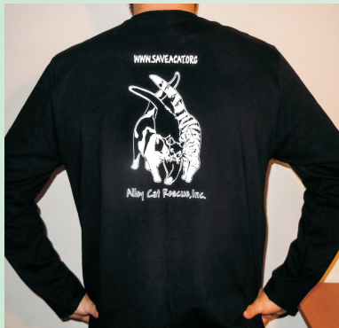
Long-Sleeve Shirt $20 each MD residents please add $1.20 tax.