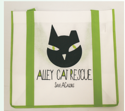
Grocery Tote Bag $10 each MD residents add $0.60 tax.