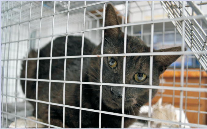
Feral cat waiting for health check, surgery, and vaccinations during TNR.

The Alley Cat Rescue Trap-Neuter-Return (TNR) clinic is at the core of our mission and is probably the most unique of our programs. Any veterinarian will spay or neuter a cat, but they don't all have traps to lend, expertise to impart, or even the willingness to treat a feral cat. That's where our TNR clinic comes in; it bridges the gap between residents who wish to help community cats and veterinary medical service providers.