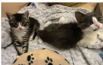
Willow and Polly

When we first trapped little flame point, Fiero from a colony, he was not used to being handled by people. Although he wasn't aggressive or defensive, he didn't seek out human affection. We were sure he would eventually become a "lap cat," and after some time and patience, he grew to become the sweetest boy who is super social with both other cats and people.