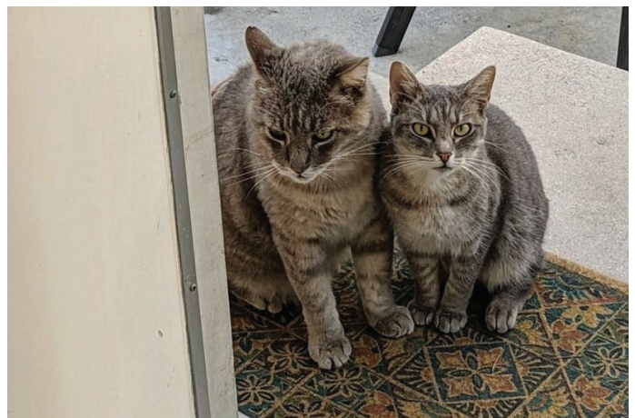
Mother and daughter, relocated to a barn home by ACR

A list of Working Cats programs by state can be found at saveacat.org/shelters-with-working-cat-progrmas.html .