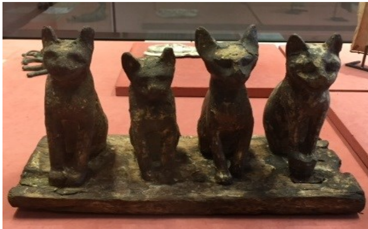
The ancient Egyptians revered cats and immortalized them in statue form.

The early Christian church became aware of the link between so-called pagan reli-