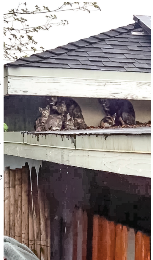
Moms & kittens on a roof in LA.

Our Maryland crew have been hard at work TNR'ing with local businesses and residents, running the Cheap Fix spay/neuter clinic, and of course, rescuing cats and kittens and nursing them back to health. Finding Kubo n our doorstep- We've seen a rash of major injuries this year, many requiring amputation and extended healing time and rehabilitation. Adult cats Thor, Tatito, and Zoe all lost legs, as did kittens Fife, Marleny, and Uma. For all these cats who'd been living outside, these were life threatening injuries. Thanks to our amazing partner veterinarians and your financial support, each one received life-saving care, was nursed back to health, and then placed in a forever home.