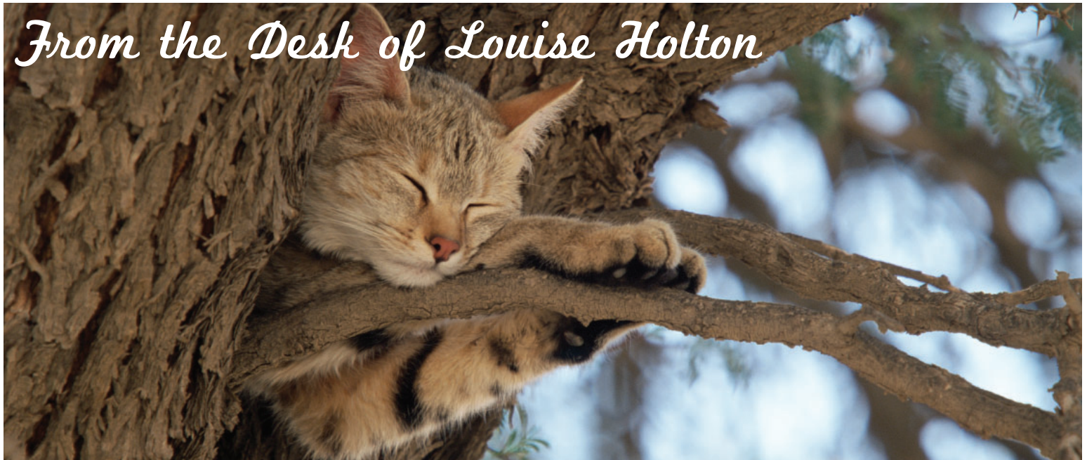
The African wildcat, Felis silvestris lybica.

A few years ago Alley Cat Rescue supported a group TNR'ing at the Sun City resort, bordering the Pilanesberg Game Reserve near Johannesburg, where there are African wildcats living. It would be a terrible tragedy to allow the small wildcats of the world, especially this one from whom our domestic cats descend, to simply die out. We are again working with scientists, the veterinary community, and TNR groups in South Africa around Kruger National Park.