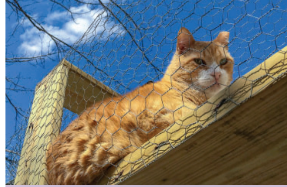
Some believe all cats should be confined and outdoor access limited to