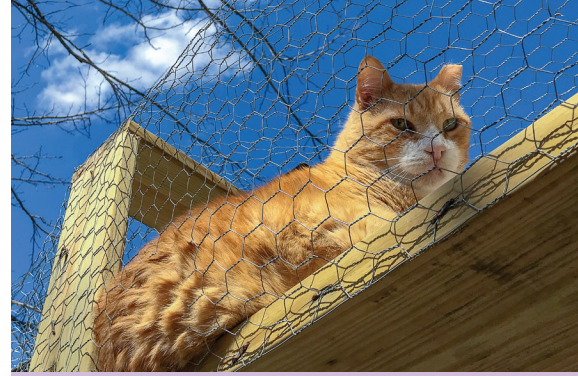
Some believe all cats should be confined and outdoor access limited to