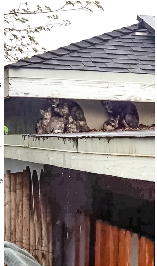
Moms & kittens on a roof in LA.

Our Maryland crew have been hard at work TNR'ing with local businesses and residents, running the Cheap Fix spay/neuter clinic, and of course, rescuing cats and kittens and nursing them back to health. Finding Kubo n our doorstep- We've seen a rash of major injuries this year, many requiring amputation and extended healing time and rehabilitation. Adult cats Thor, Tatito, and Zoe all lost legs, as did kittens Fife, Marleny, and Uma. For all these cats who'd been living outside, these were life threatening injuries. Thanks to our amazing partner veterinarians and your financial support, each one received life-saving care, was nursed back to health, and then placed in a forever home.