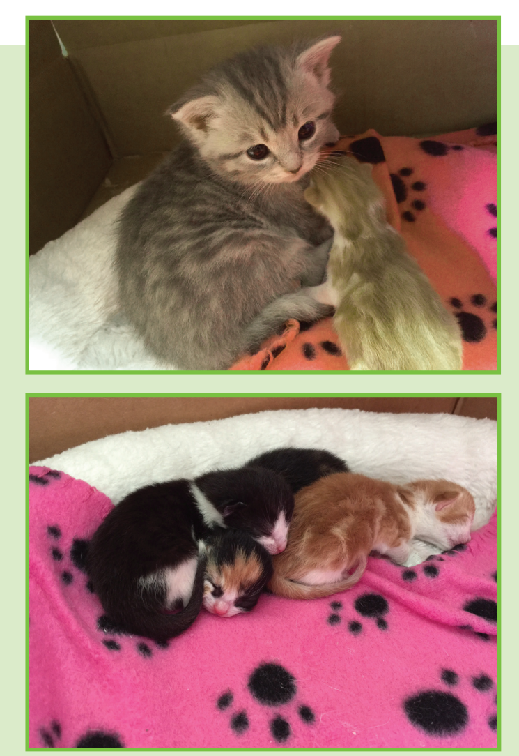
Miss Foxy (top), orphan kittens (bottom)

There has been similar progress with the relationships between feral cat groups and local governments. In comparing the results from 2012 to 2016, there has been a 22% decrease in feral cat rescues finding it "difficult"