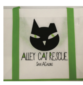
Grocery Tote Bag • $8 Save plastic & trees with our eco-friendly shopping bag.

"This is the purrfect, comprehensive resource for anyone interested in helping homeless cats. I wish I'd had it when I started caring for my colony twenty-one years ago." - Amazon Review