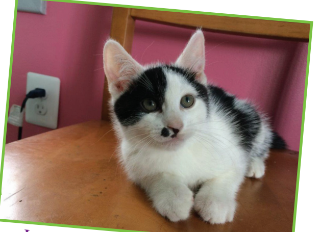
Jon Snow (adopted)