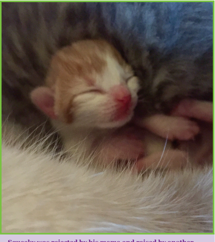
Squeeky was rejected by his mama and raised by another mother cat, Sophie.

Cat rescue organizations cannot tackle this problem alone; we need the support of the veterinary com¬munity. By establishing long-term relationships between vets and rescuers, together we can help each town's stray cat population.