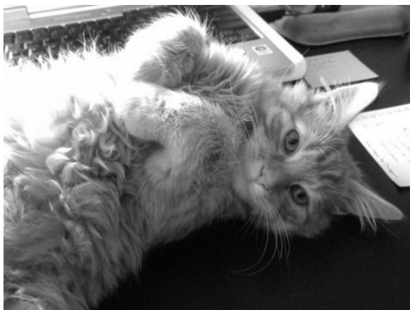
Harry William Liam, feral kitten rescued by Alley Cat Rescue.

should be trapped and sterilized, rather than killed. And although he lived in Pennsylvania, he would visit his Ocean Reef home for one week every month, during which time he started trapping cats and taking them to a local vet to be sterilized.