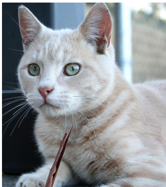
Billie, rescued by Alley Cat Rescue.