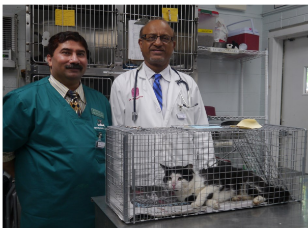
Alley Cat Rescue

ers need to follow (with the important message that the cats must remain in their traps), and the terms of payment, including whether some of the cost is a donation by the clinic. The caretaker should also let the clinic know if the cats will be returned to the outdoor colony or kept for possible adoption, fostering, barn homes, etc.