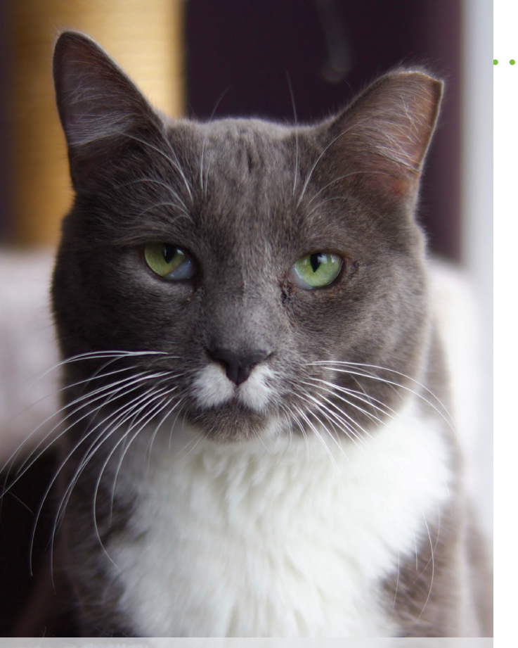
FORMER FERAL DENISE, now a friendly permanent resident of Alley Cat Rescue.