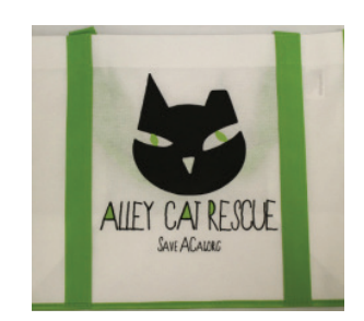
Grocery Tote Bag • $8 Save plastic & trees with our

"This is the purrfect, comprehensive resource for anyone interested in helping homeless cats. I wish I'd had it when I started caring for my colony twenty-one years ago." - Amazon Review