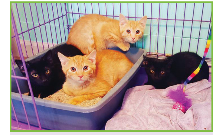
FOUR KITTENS FOUND by a professor at the University of Maryland, taken in and cared for by Alley Cat Rescue.

They require extra care, sometimes around the clock. My one baby was three days old, and he arrived at my door very cold and wet; not a good thing. He arrived with his baby brother and despite my best efforts to get them warmed up first and then fed, one sadly died overnight.