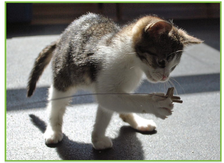
FOUND UNDER A PORCH just a few hours before a major snowstorm, Marlin, a feral kitten, is socialized by ACR staff.

combat secondary bacterial infections. Conjunctivitis of the eyes requires constant cleaning with moist, warm cotton balls and application of Terramycin or Chlorasone a few times per day directly in the eyes. If left untreated, upper respiratory infections can cause severe health problems, including pneumonia, blindness, or even death.