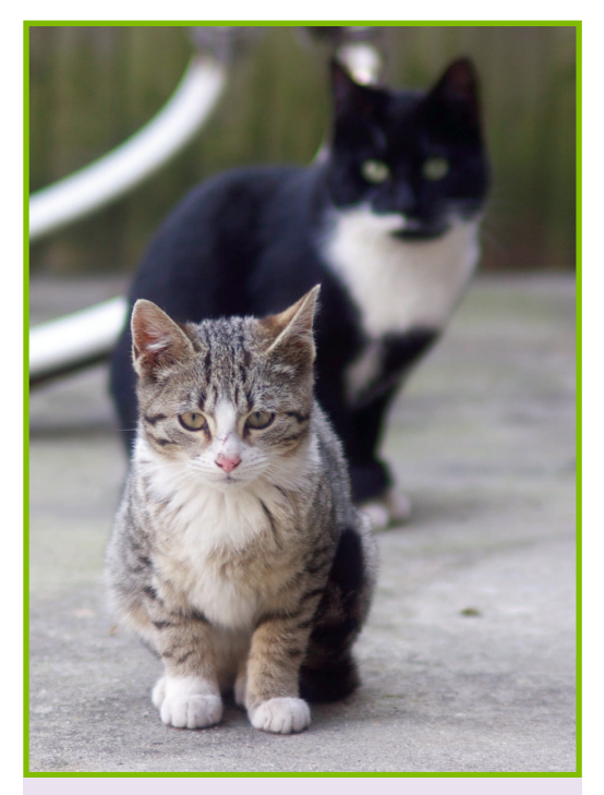
THE MAJORITY OF KITTENS in U.S. shelters are born to free-roaming cats.

Alley Cat Rescue launched Feral Cat Spay Day (FCSD) in 2010 to encourage the veterinary community to offer free and low-cost Trap-Neuter-Return (TNR) services to those who care for community cats. To date, roughly 900 veterinary hospitals across the world have spayed or neutered over 9,500 community cats in honor of this day! This year we're asking veterinarians to go even bigger by offering these services throughout the entire month of May in order to increase awareness of and support for the cats in their communities. We are calling this bold, new initiative the May Spay Challenge.