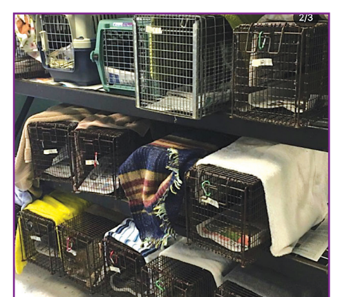
ACR Extends FFC

of spay/neuter clinics, the Challenge will be extended through the end of October in order to sterilize cats before kitten season begins. Participating vets are critical