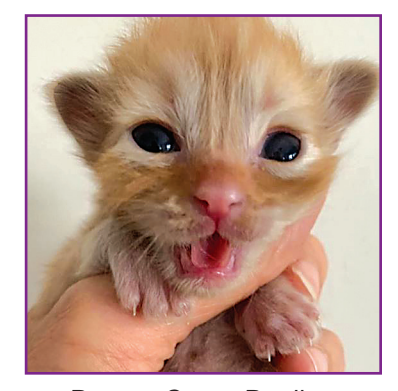
Rescue Story: Rooibos

Rooibos, along with his five siblings, were also rescued