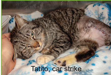
Tatito, car strike