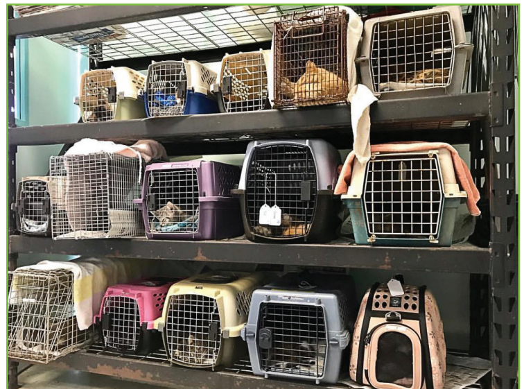
ACR's low-cost spay/neuter clinic in Maryland serves feral & pet cats. Thousands of cats are sterilized each year through ACR's programs in Maryland, Virginia, and Los Angeles.