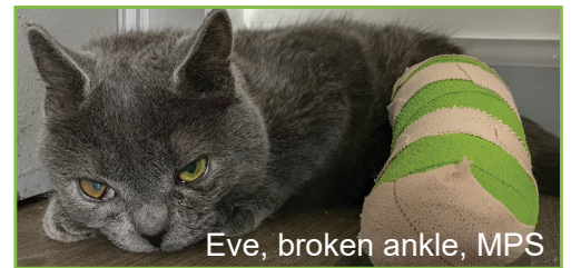
Eve, broken ankle, MPS