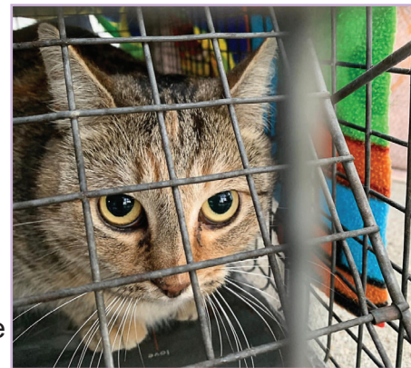
A trapped feral cat from among a colony of 200 at an L.A. mall.

Also, sign our petition to bird and conservation groups on the last page of this report. Their lawsuit is the reason that so many cats are suffering in L.A. right now. We must let them know that until they support TNR, we will NOT support them!