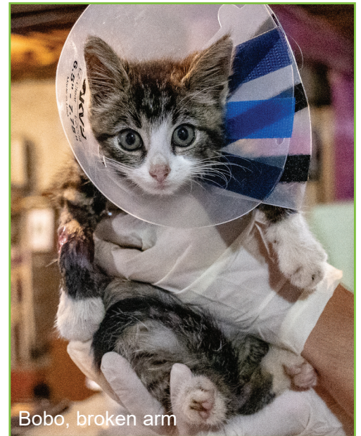
Bobo, broken arm