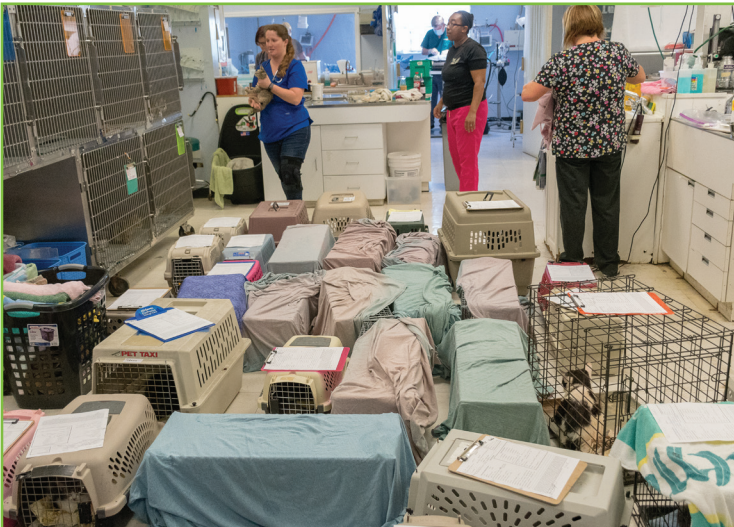
Cats awaiting sterilization at Angels of Assissi in Roanoke, VA. ACR sponsored two free spay/neuter and rabies vaccination clinics there that served 200 cats over two days.