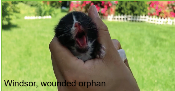
Windsor, wounded orphan