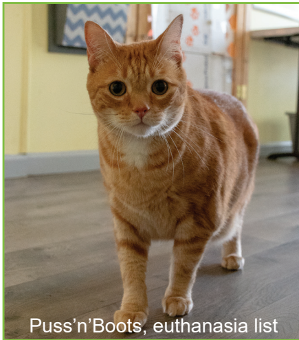
Puss'n'Boots, euthanasia list