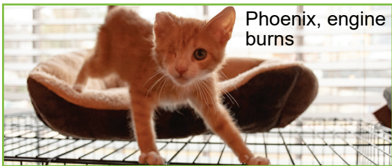
Phoenix, engine burns