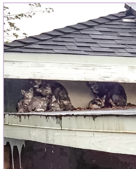
Two feral mothers & their kittens who were rescued from a rooftop.