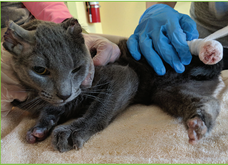
Hardy was abused and needed weeks of treatment. He recovered and was adopted into a loving, forever home!

This year you made it possible for ACR to help so many cats in need. Hardy and Olive were both abuse victims, and kitten Lucha had terrible, life-threatening injuries. Beyond major medical treatment, we brought kittens and former strays back to full health and found them homes. We sponsored spay/neuter clinics to serve cats on a budget, and we grew the community of people working for cats by promoting TNR, holding local workshops, and providing information and education to empower colony caregivers and cat owners alike.