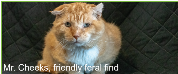
Mr. Cheeks, friendly feral find