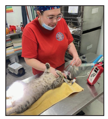
Feral Cat Being Prepared for Surgery in NC

Research has shown that community cats in stable colonies live happy, long lives.